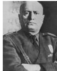
Mussolini - Italy